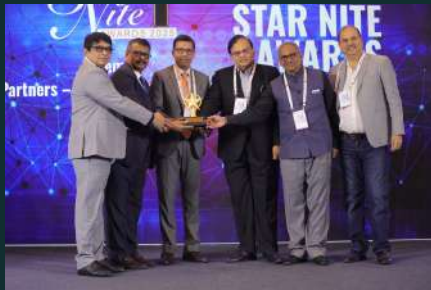
Association of System Integrators & Retailers in Technology(ASIRT)