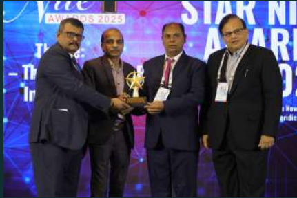
Trade Association of Information Technology Mumbai (TAIT)