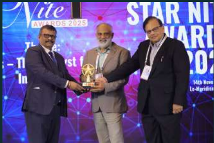
Infotech Software Dealers Association (ISODA)