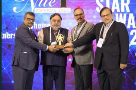
Punjab Association of Computer Traders(PACT)