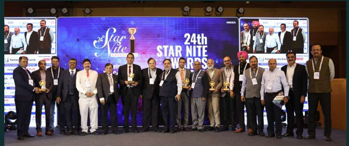
IT Association Award - Group Photo